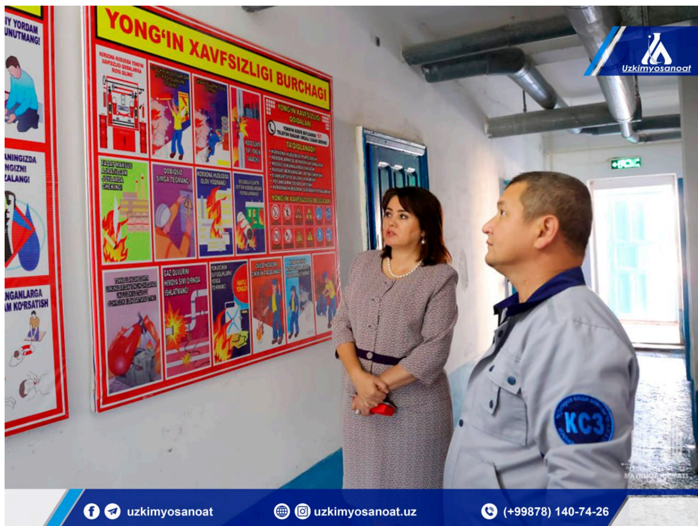
Tashrif davomida korxonada davlat tilida ish yuritish masalalari bo'yicha hujjatlar bilan tanishildi. Xato va kamchiliklarni bartaraf etilishi bo'yicha mutasaddilarga vazifalar yuklatildi.